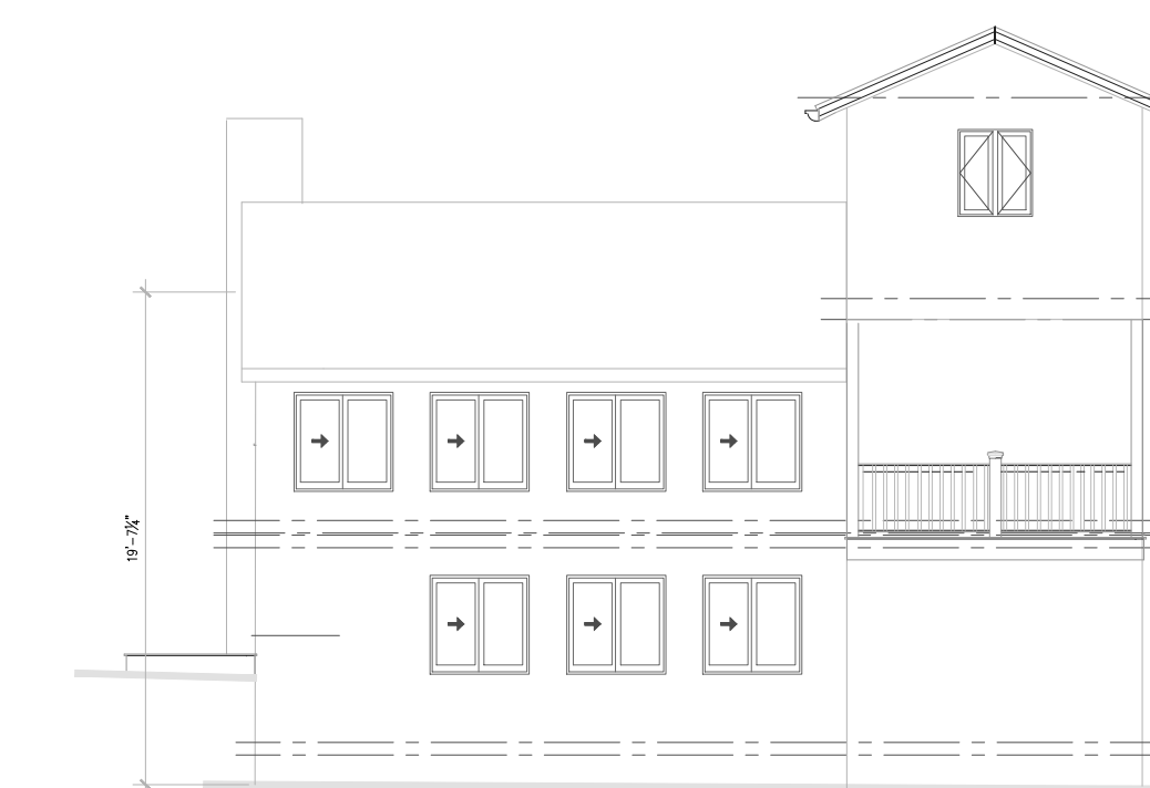
EXISTING FRONT (EAST) ELEVATION SCALE: 1/8" = 1'-0"