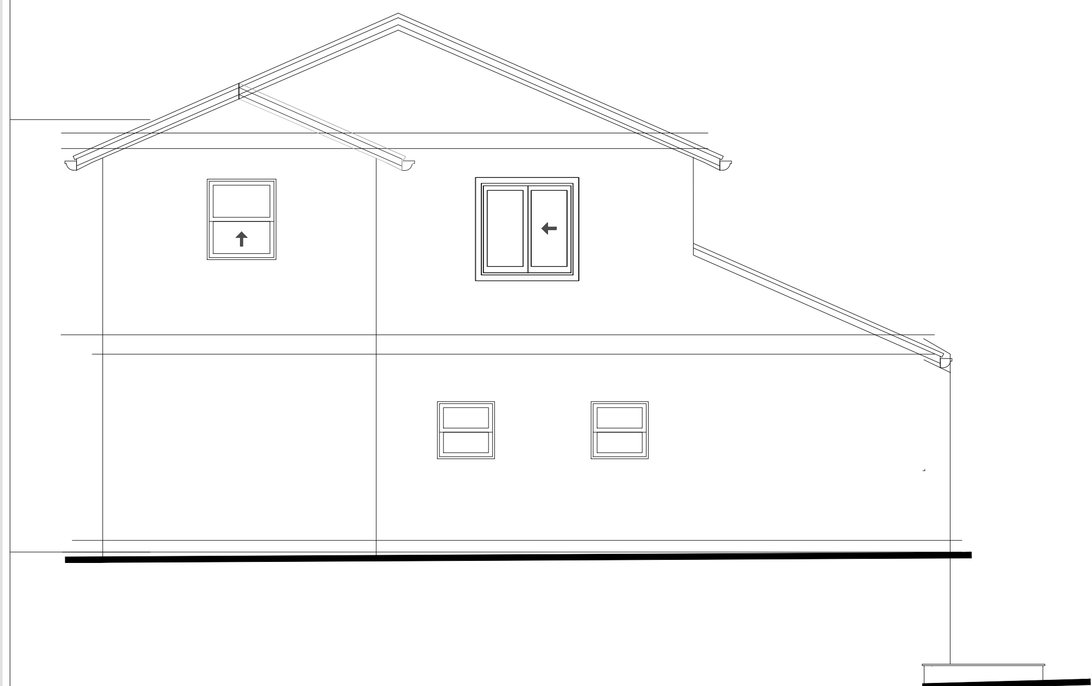
PROPOSED REAR (WEST) ELEVATION SCALE: 1/4" = 1'-0"