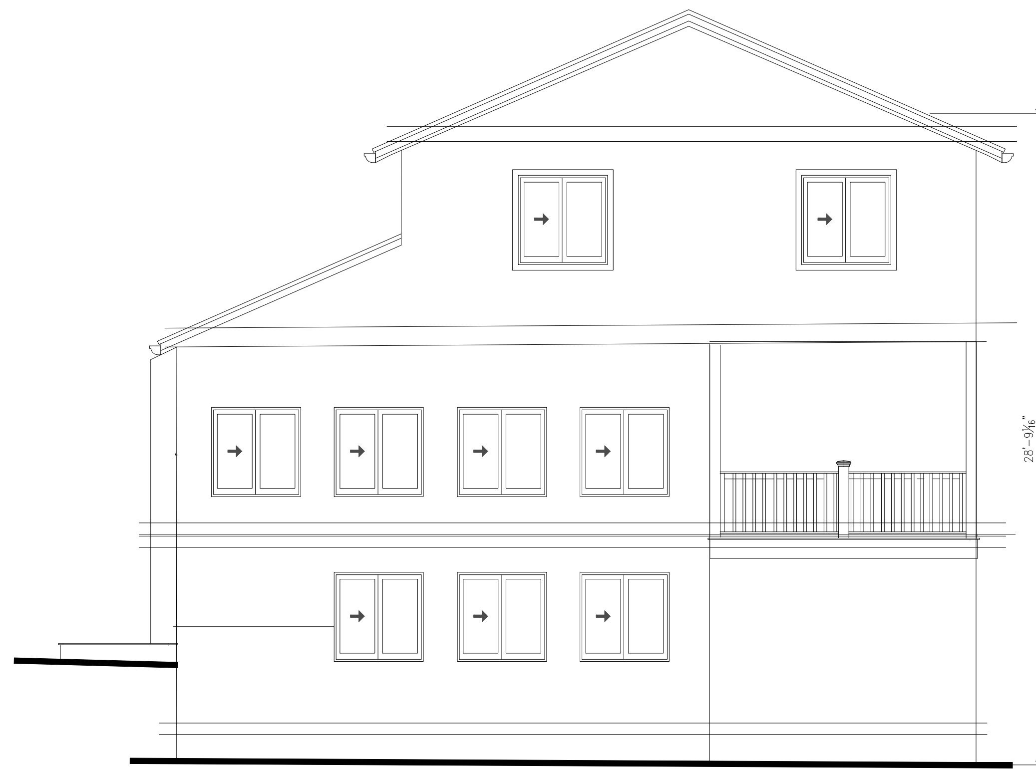
PROPOSED FRONT (EAST) ELEVATION SCALE: 1/4" = 1'-0"