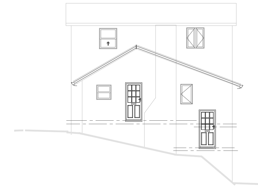
EXISTING SIDE (SOUTH) ELEVATION SCALE: 1/8" = 1'-0"