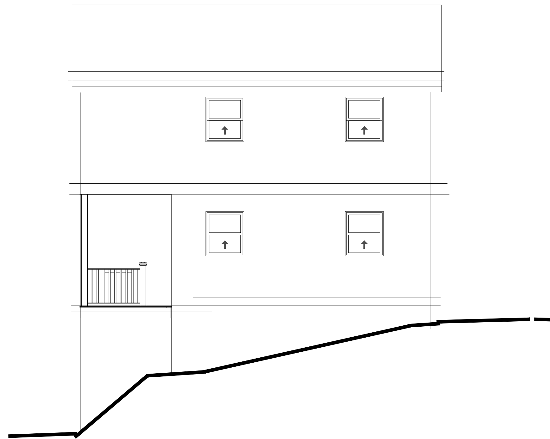
PROPOSED SIDE (NORTH) ELEVATION SCALE: 1/4" = 1'-0"