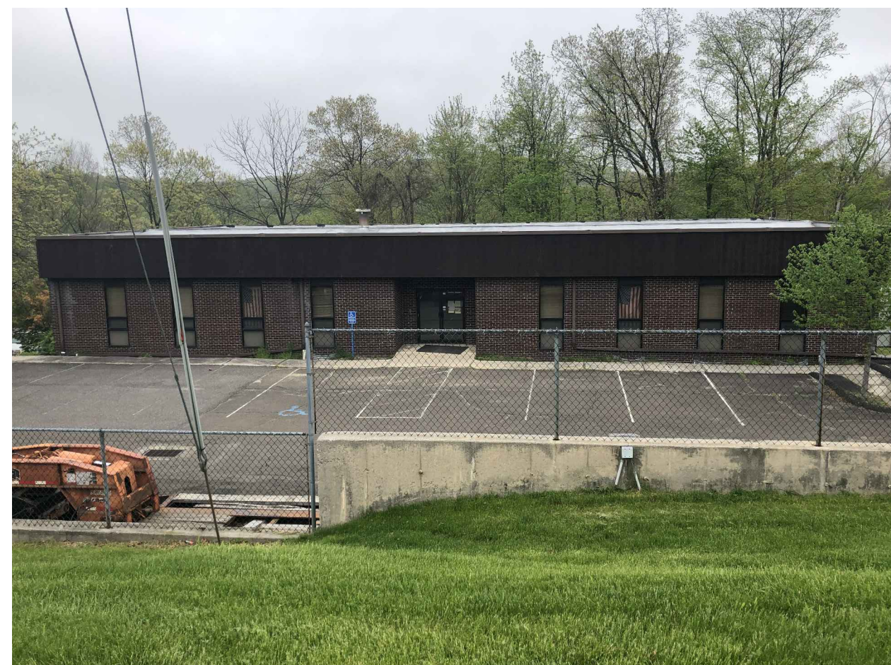
3 FRONT ELEVATION SCALE: NONE