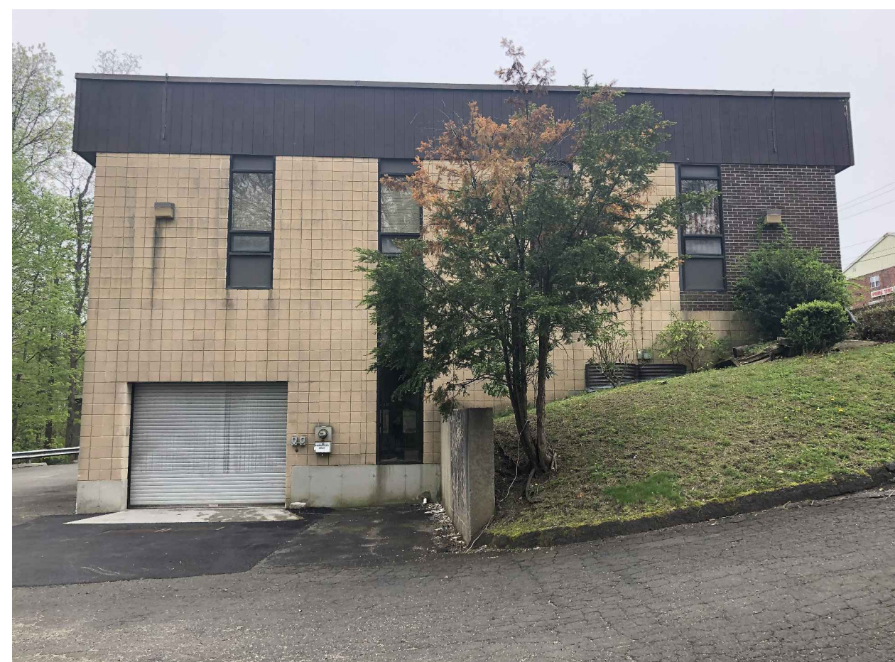
4 NORTH SIDE ELEVATION SCALE: NONE