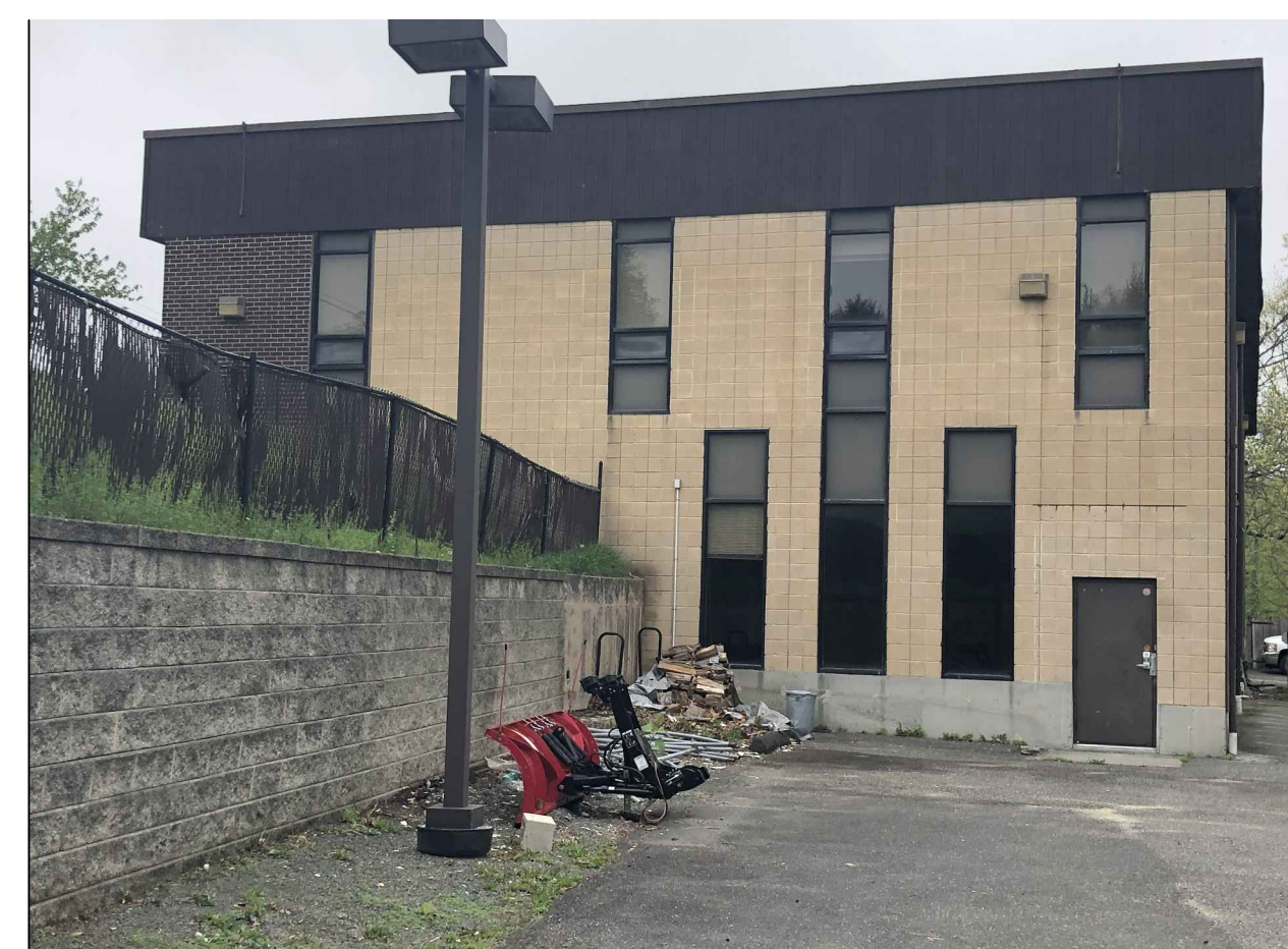
6 SOUTH SIDE ELEVATION SCALE: NONE