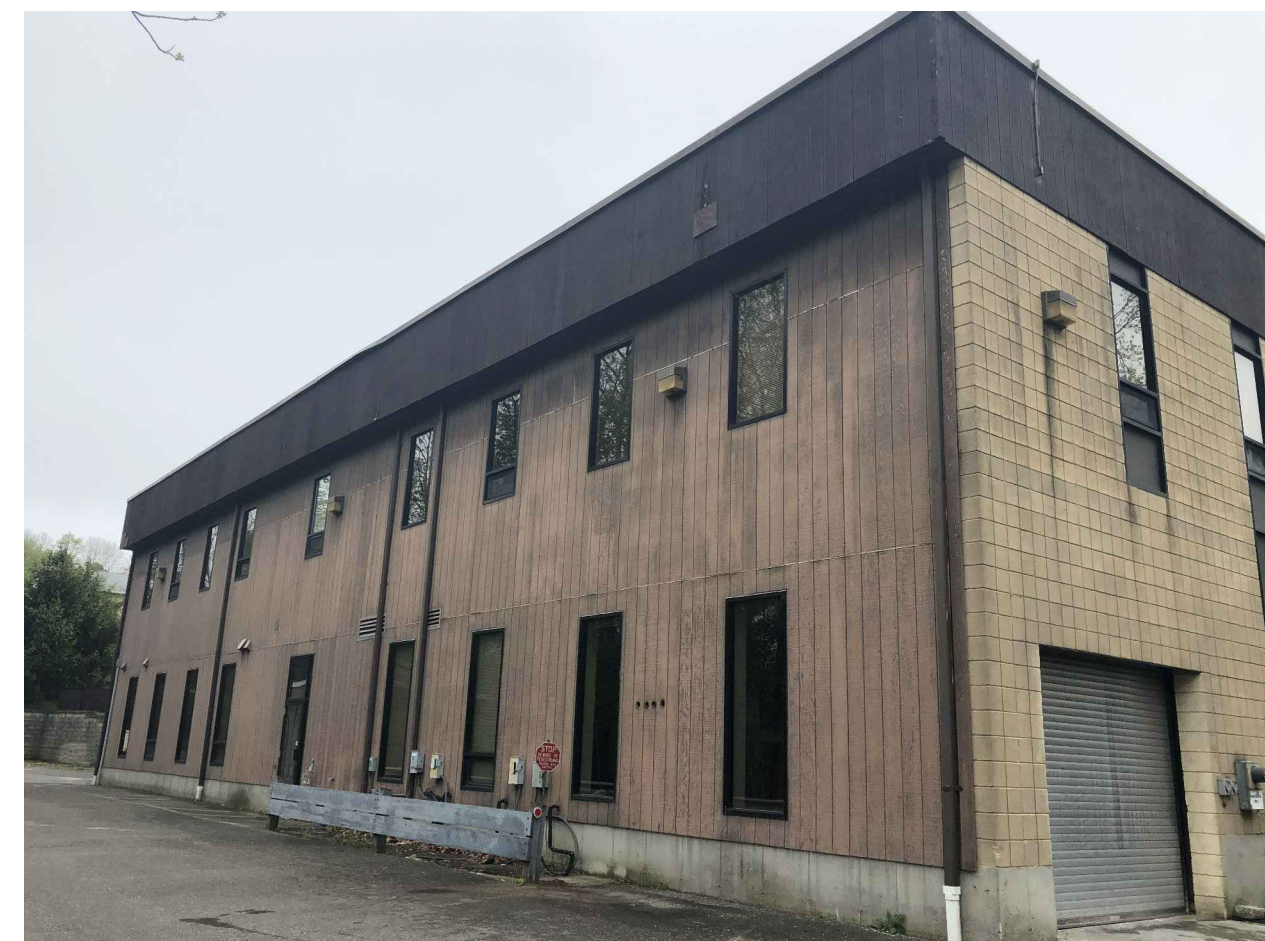
5 REAR ELEVATION SCALE: NONE