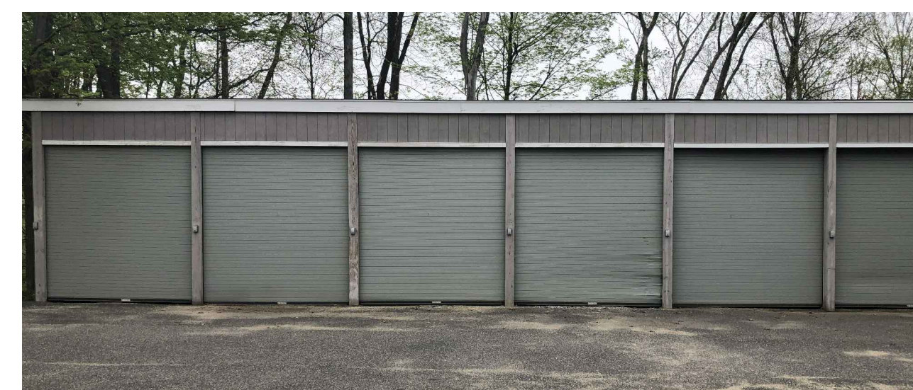
10 OUTBUILDING ELEVATION SCALE: NONE